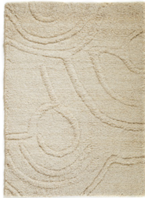
natural monochrom OOAKNRL-1