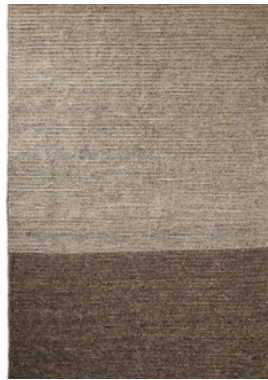
light grey melange/ brown melange 00AFR7-B