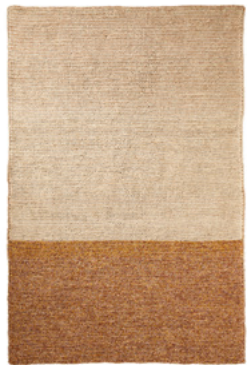
natural rose/ terracotta yellow melange 00AFR6-D