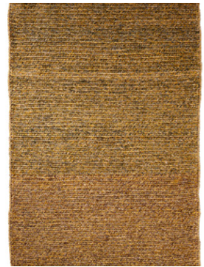
greenrose /terracotta yellow melange 00AFR7-C