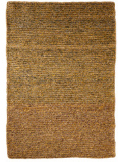
greenrose /terracotta yellow melange 00AFR5-C