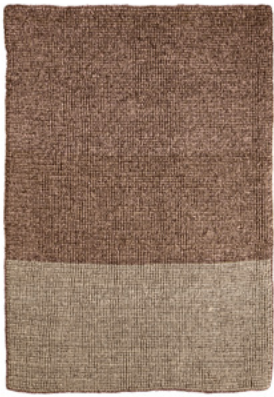
cacao melange/ brown melange 00AFR7-A