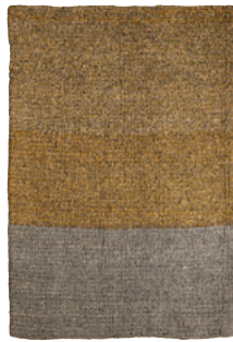
greenrose/ light grey melange 00AFR5-E