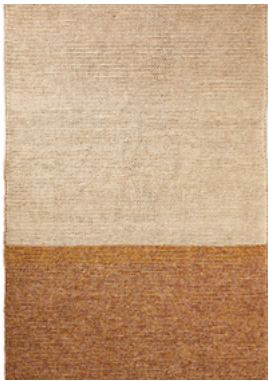
natural rose/ terracotta yellow melange 00AFR7-D