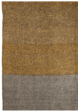
greenrose/ light grey melange 00AFR7-E