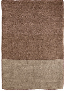
cacao melange/ brown melange 00AFR5-A