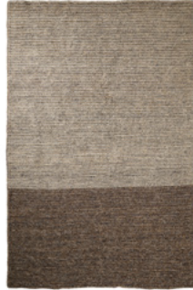
light grey melange/ brown melange 00AFR5-B