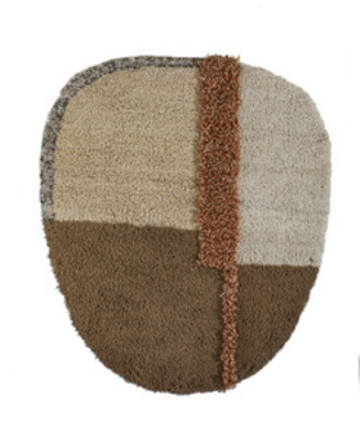
cream/beige/caramel brown 00ANURS53