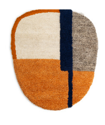
marine blue/copper brown/ochre 00ANURS33