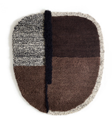
nut brown/dark brown/black/grey 00ANURL43