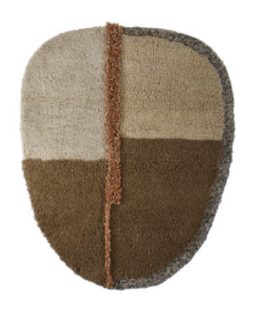
cream/beige/caramel brown 00ANURL53