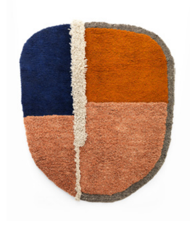
marine blue/copper brown/ochre 00ANURL33