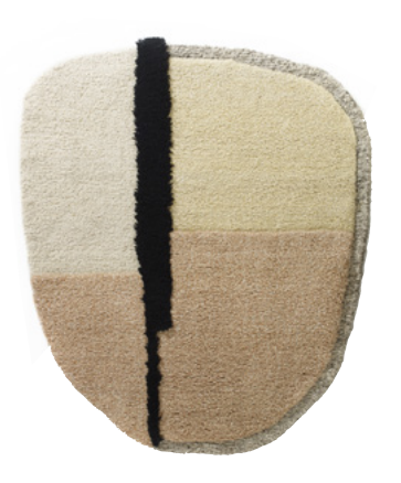
cream/beige/soft pink 00ANURL13