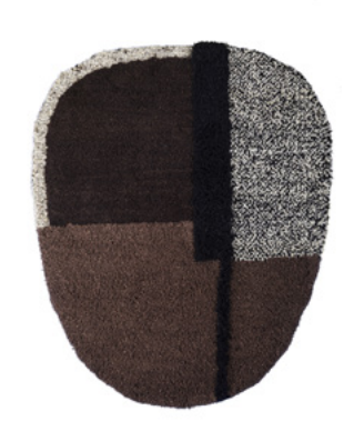
nut brown/dark brown/black/grey 00ANURS43