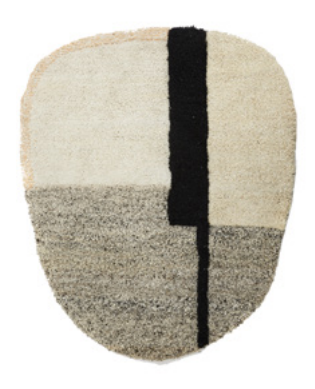
cream/beige/soft pink 00ANURS13