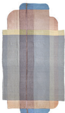
grey/purple/light blue OOANERL-1