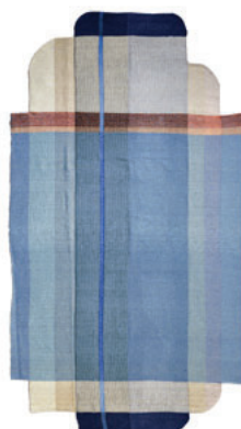
light blue/grey/dark blue OOANERL-2