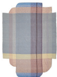
grey/purple/light blue OOANERM-1