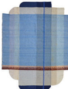
light blue/grey/dark blue OOANERM-2