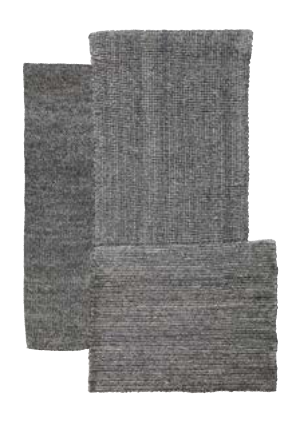
shadow grey/white 00AFR2-B