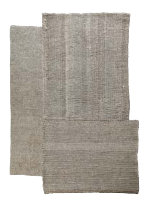
dark natural 00AFR2-A